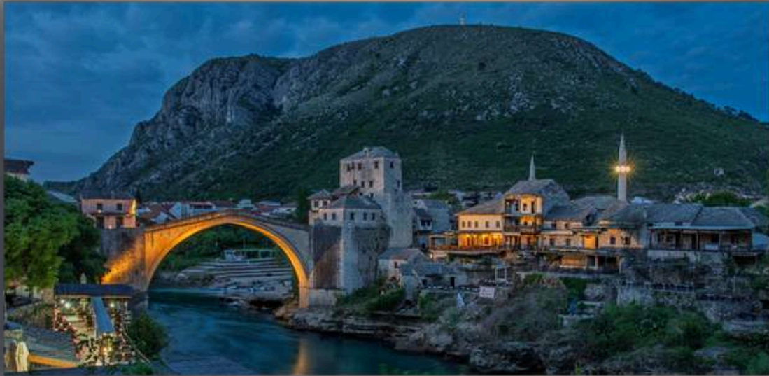
"Blue Hour in Mostar" by Nyasha Godoka

" One of my favourite things when travelling is exploring a town or city early in the morning, before it wakes up. In those quiet hours, it feels as though the place tells its own story, and I can wander freely as if it belongs only to me. This photo shows Stari Most (the Old Bridge), a 16th-century landmark destroyed in the Croat-Bosniak war in 1993 and rebuilt in 2004. Captured during the blue hour, the bridge embodies resilience — a reminder that, just like people, a place can endure hardship and still remain remarkable. My favourite detail is the small cross on top of the mountain, small but impactful, completing the scene"